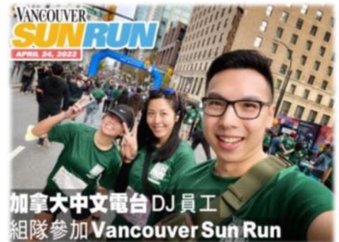
加拿大中文電台 DJ 員工 組隊參加 Vancouver Sun Run